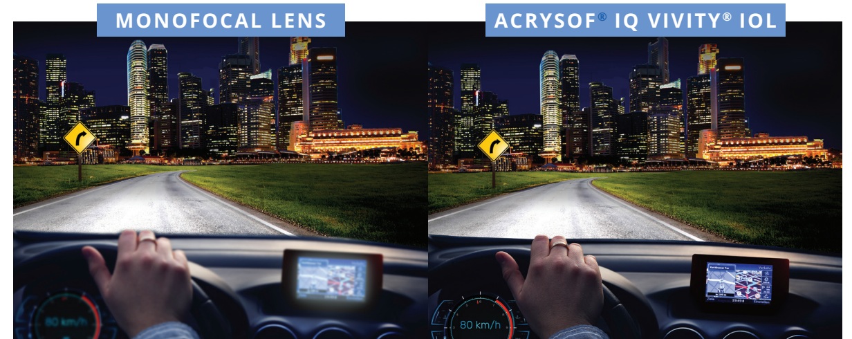
The simulated images above are for illustrative purposes.

Patients should exercise caution while driving at night.